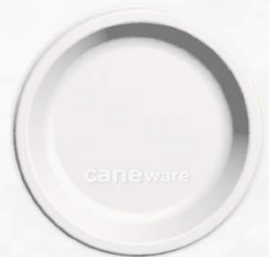
Compact 6" PCS Per Pack : 50