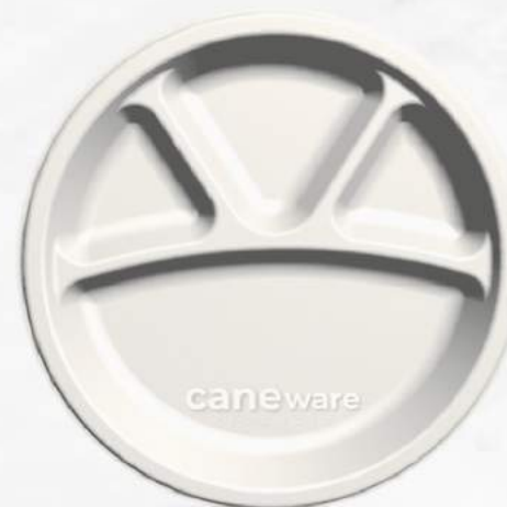
QuadraServe 11" PCS Per Pack : 25