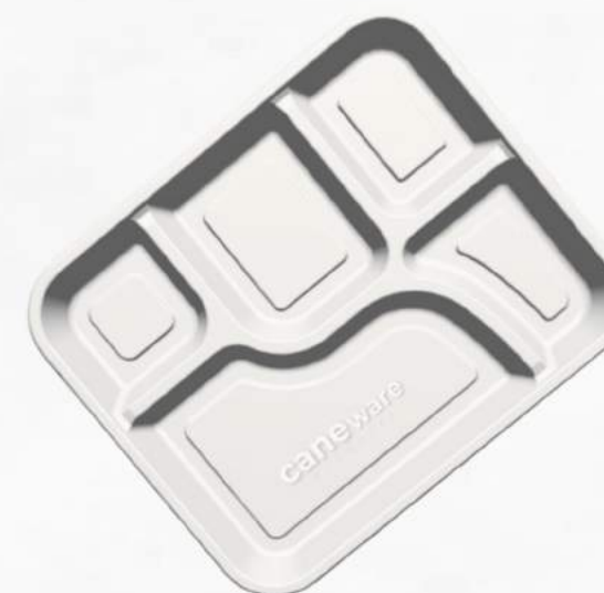
King Tray PCS Per Pack : 25