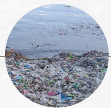
In 3 Months