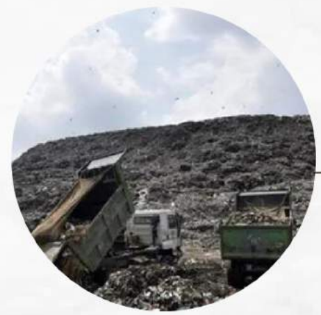
In 300 Years