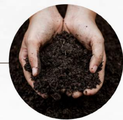
In 3 Months