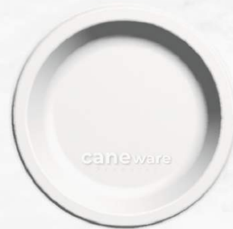
Reasonable 7" PCS Per Pack : 50