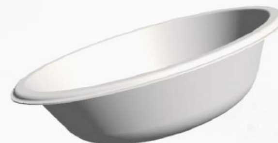
Maxi marvel 360ML