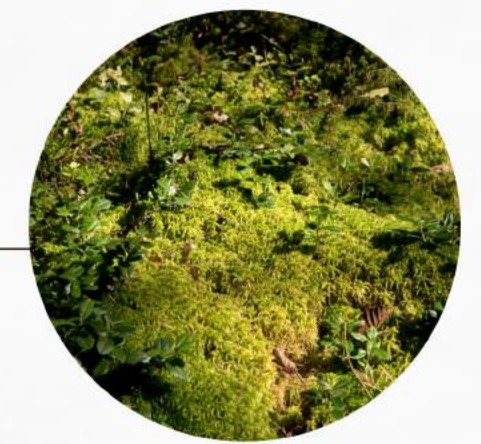
In 300 Years