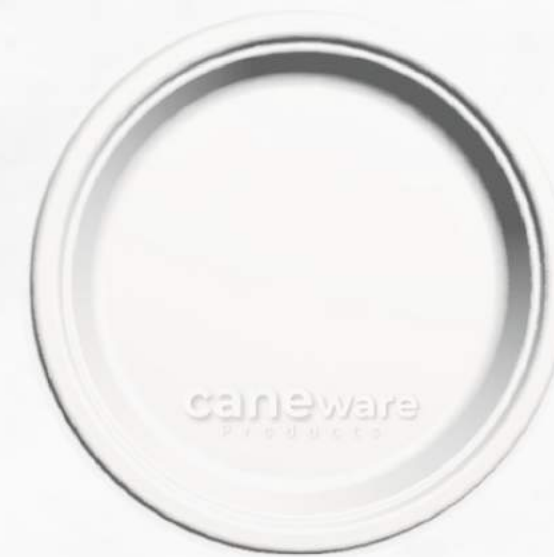
Generous 10" PCS Per Pack : 25