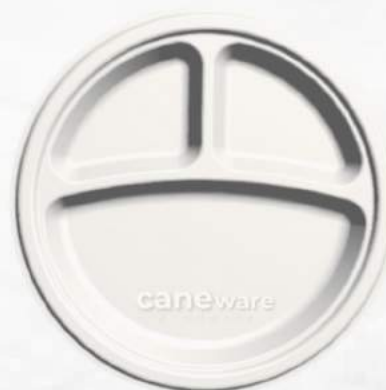
MultiServe 10" PCS Per Pack : 25